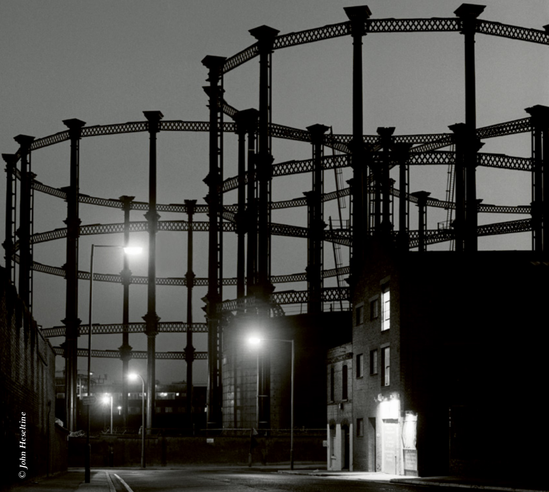
The distinctive gasholders appeared in many old photographs of London and were an equally familiar sight to the train travellers.