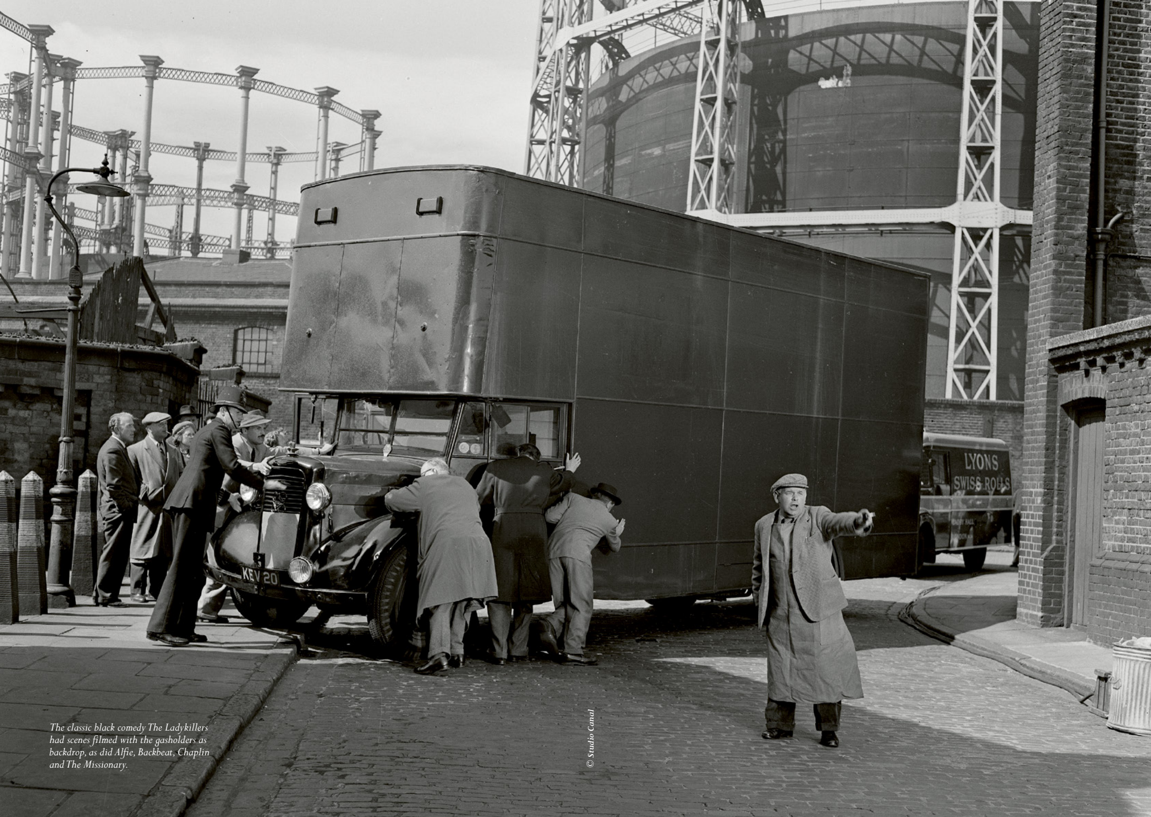
The classic black comedy The Ladykillers had scenes filmed with the gasholders as backdrop, as did Alfie , Backbeat , Chaplin and The Missionary .